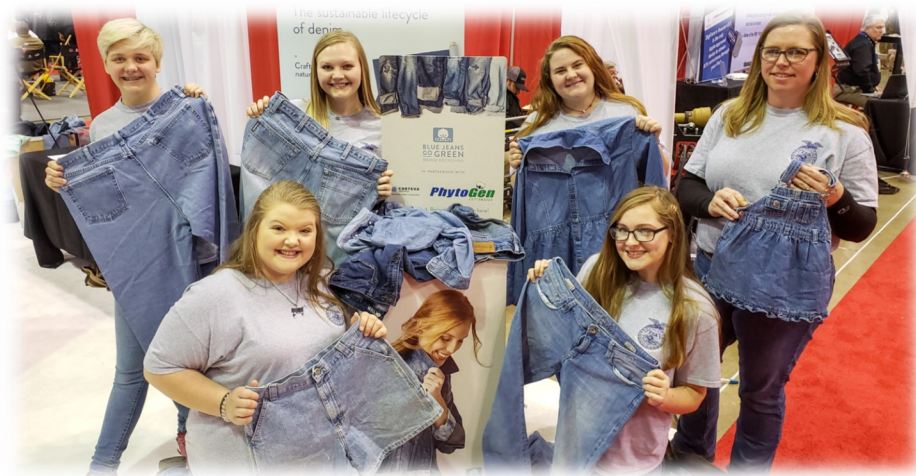
Left: Star City FFA collected and donated 1,386 denim items.

“By teaming with PhytoGen, we are showcasing how the Blue Jeans Go Green program helps to close the loop on cotton sustainability.